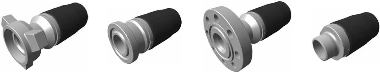
Example of ROTARY DRILLING DN 75 hose assembly

For HAMMER LUG unions please chapter COUPLINGS, VALVES AND CLAMPS.